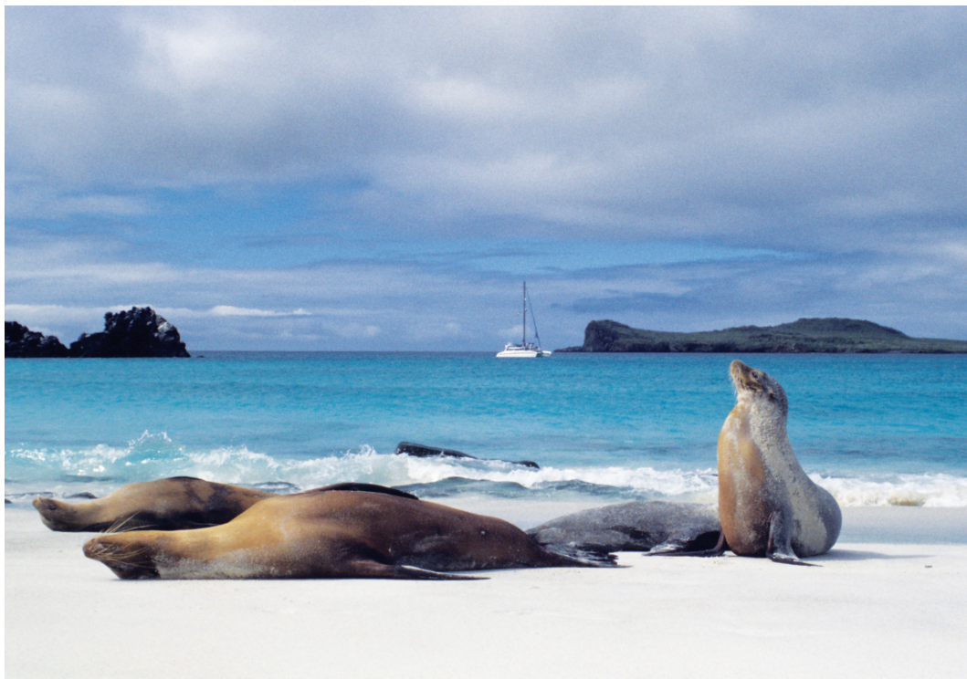
We encounter plenty of wildlife, like these sunbathing sea lions, in the Galapagos.

of the Americas and the continent's oldest continuously inhabited city. This morning we tour this UNESCO site then stop at the ruins of Sacsayhuaman fortress, a masterpiece of Incan architecture. We enjoy lunch today at a local restaurant. B,L