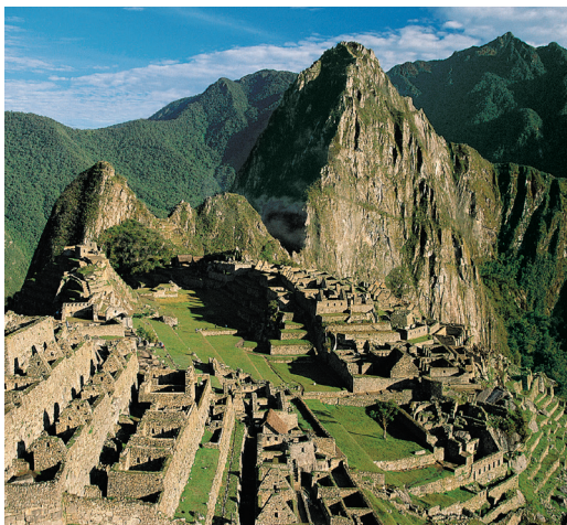
We explore the amazing ruins at Machu Picchu on Days 5 & 6.

Day 15: Quito/Depart for U.S. Nestled in Andes foothills, Quito boasts a well-preserved historic center,