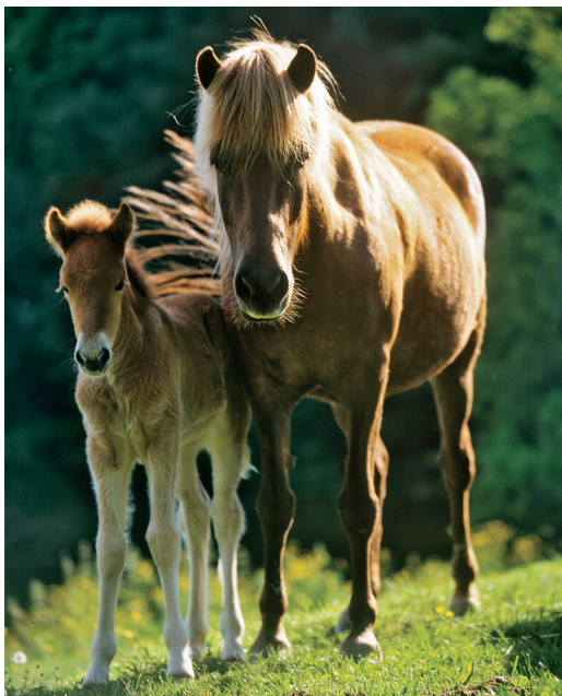
Famed Icelandic horses