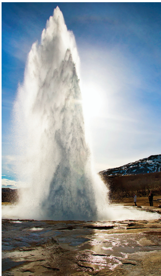
Iceland's hot spring geysers are famous natural attractions.

Day 11: Depart for U.S. Today we depart for the airport and our return flights to the U.S. B