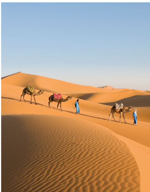
We ride camels in the Sahara.

Day 14: Depart for U.S. After breakfast this morning we transfer to the airport for our return flight to the U.S. B