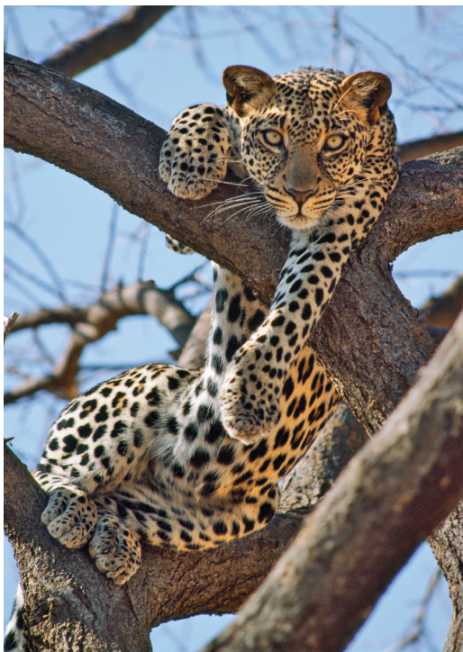
Getting comfortable ...