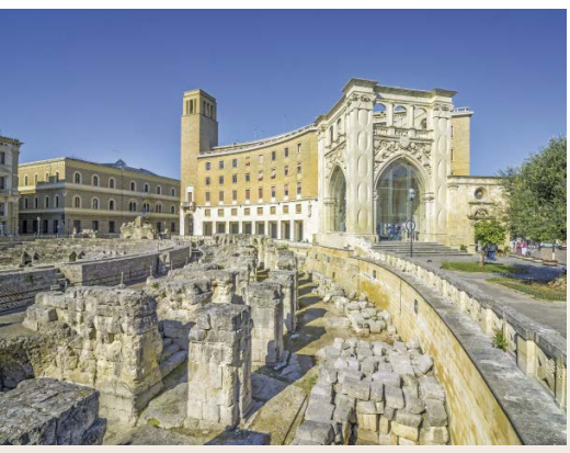
Above: Ancient Roman amphitheater and ruins, Lecce Right: Cathedral tower, Trani

Discovery: Matera. Journey through the remote region of Basilicata to Matera, home