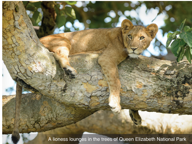
A lioness lounges in the trees of Queen Elizabeth National Park

DAY 1 Depart USA: Depart the USA on your flight to the Republic of Uganda in Africa.