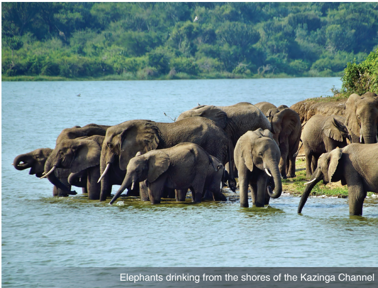
Elephants drinking from the shores of the Kazinga Channel

Park. Home to approximately half of the world's endangered mountain gorillas, this ancient forest unfolds over the steep ridges of the Albertine Rift Valley, providing breathtaking views and extraordinary wildlife viewing. Upon arrival, time permitting, set out on a tour of the Batwa cultural trail and surrounding community. Relocated outside of the park as part of wildlife conservation efforts, this ancient hunter-gatherer tribe now shares their stories, songs, and traditions with visitors.