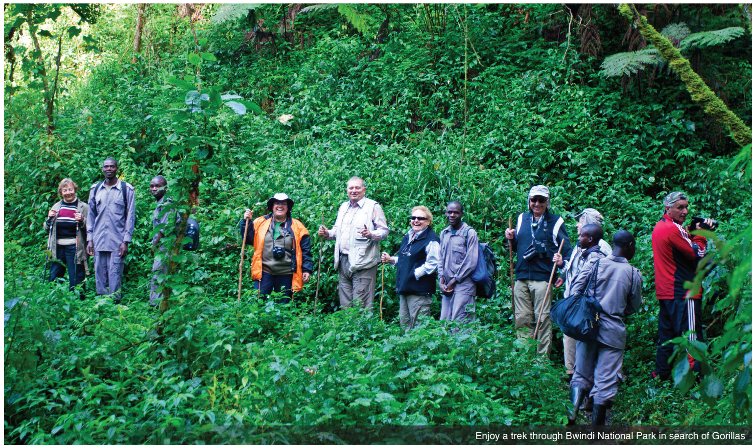
Enjoy a trek through Bwindi National Park in search of Gorillas