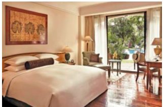
Sofitel Angkor Phokeethra Golf and Spa Resort | Siem Reap, Cambodia