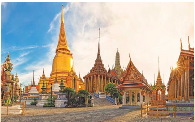
Grand Palace complex, Bangkok