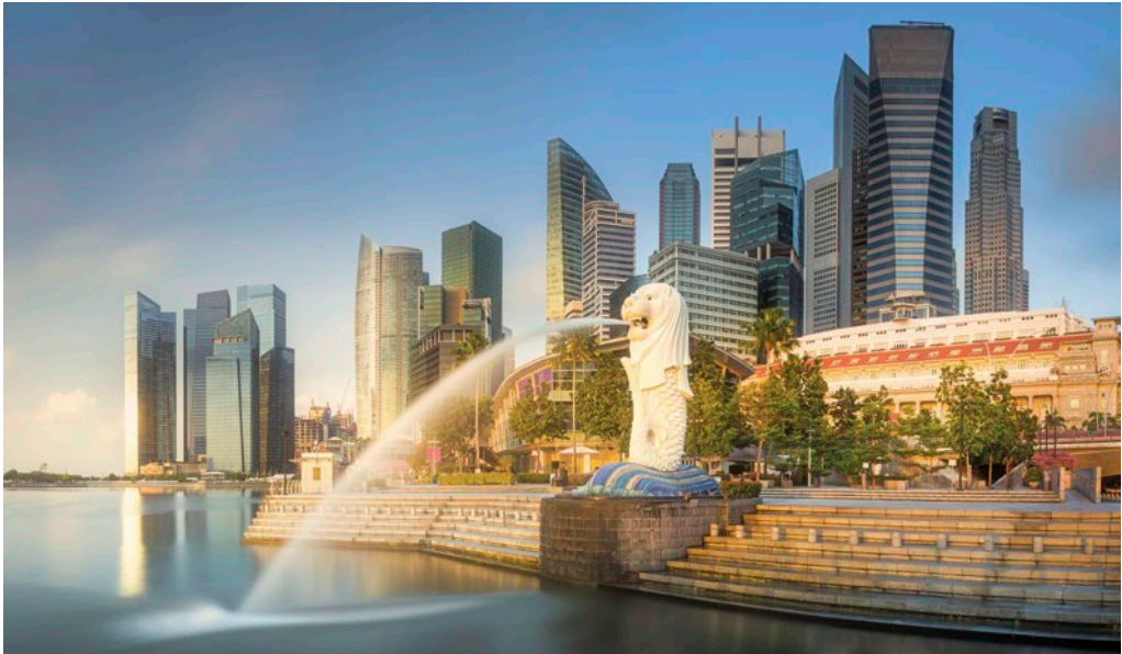
Merlion Park, Singapore

Depart gateway city for Bali, Indonesia. 🌐 Cross the international date line.