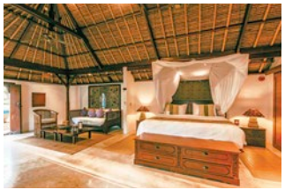
Belmond Jimbaran Puri Resort | Bali, Indonesia