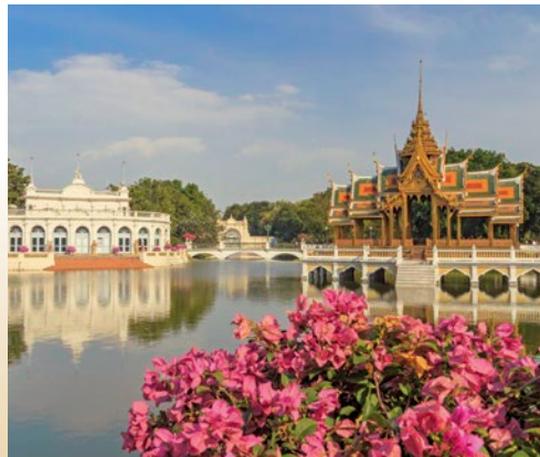
Bang Pa-In Palace

🌐Elective | Sala Rim Naam. Join an evening immersed in Thai culture. This unique experience features a Thai dance show and a dinner of classic Thai dishes.