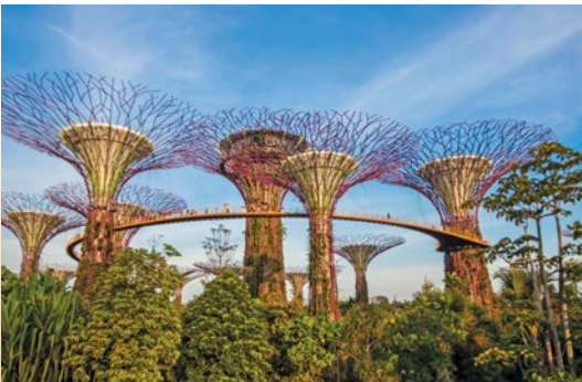
Gardens by the Bay, Singapore

Gardens by the Bay. Discover Singapore's landmark oasis of floral features and garden artistry. See the iconic Supertrees, made up of over 150,000 plants, plus bromeliads, orchids, ferns and climbers. Chart your own course through the Flower Dome, the world's largest