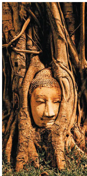
Buddha head, Ayutthaya

Knowledgeable Lecturers deepen your appreciation for the region and its history, culture and current events.