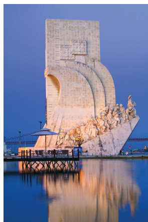
Lisbon's Monument to the Discoveries

Day 13: Madrid Our morning tour of this monumental and dignified capital city includes vast Plaza Mayor; the Moorish medieval district; and opulent