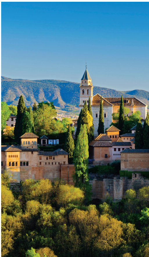
The hilltop Alhambra palace and fortress in Granada

18 th -century Palacio Real (Royal Palace). Then we sample some of Madrid’s specialties over a lunch of tapas . Our tour ends at the Prado, one of the world’s greatest museums, displaying treasures by Spanish masters Goya, El Greco, and Velazquez. The remainder of the day is free for independent exploration. Well known for its