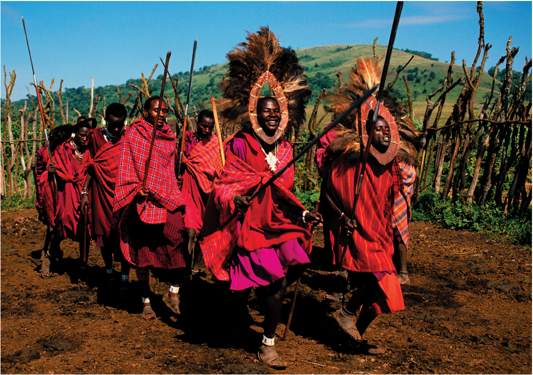
We visit a Maasai village to learn about their culture.

Day 8: Ngorongoro Crater On our morning tour of the 100-square-mile crater, we have our only chance to see all of Africa’s “Big Five” – elephant, buffalo, rhino, lion, and leopard – in one place. B,L,D