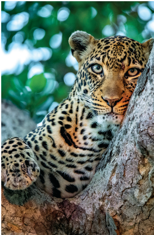
Leopard in the Serengeti

Day 16: Arrive U.S. We reach the U.S. today and connect with our flights home.