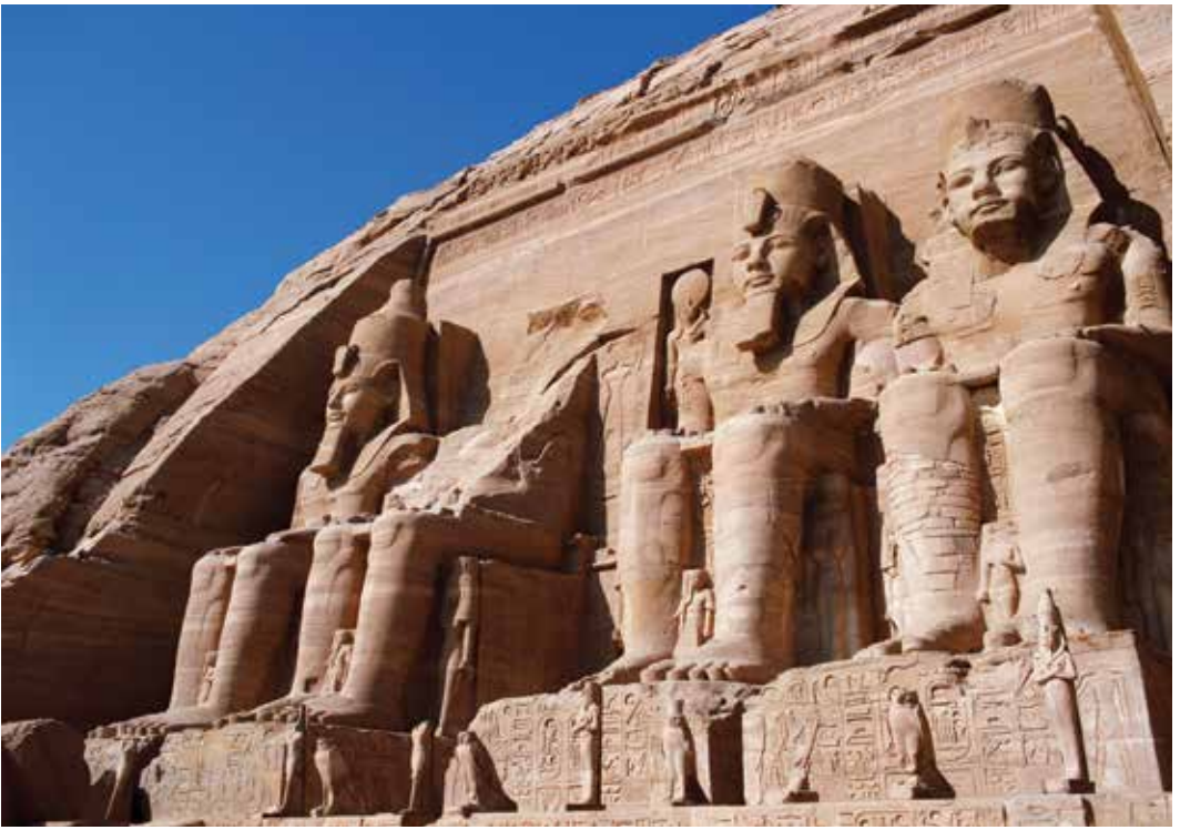
The magnificent temples at Abu Simbel commemorate Ramses II and his queen, Nefertari.

the striking avenue of sphinxes in Wadi el-Seboua’s “Valley of the Lions” then cruise to Aswan. B,L,D