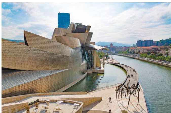
Guggenheim Museum, Bilbao