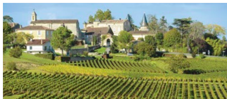
Jurisdiction of Saint-Émilion

OSU Alumni Association Travel Program Mission To promote fellowship, education and enjoyment for Oregon State University alumni, their families and friends by providing attractive travel and lifelong learning opportunities.