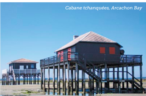
Cabane tchanquéés, Arcachon Bay

San Sebastián. Called Donostia in Basque, San Sebastián became known as a resort town when Queen Isabella II chose it as her summer seaside retreat in the mid-1800s. Spanish royalty and aristocrats followed, and the city expanded with grand Belle Époque buildings. See its highlights, including the 18th-century, baroque Basílica de Santa María del Coro, on a guided walk through the buzzing old town and along the waterfront promenade by spectacular La Concha Bay.