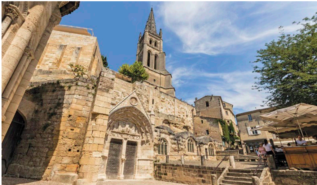
Monolithic Church, Saint-Émilion