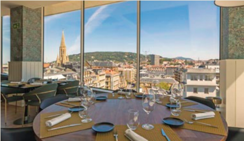
Catalonia Donosti Hotel | San Sebastián