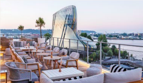
Renaissance Bordeaux Hotel | Bordeaux