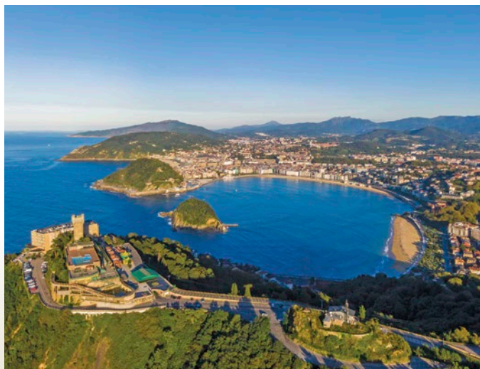
La Concha Bay, San Sebastián