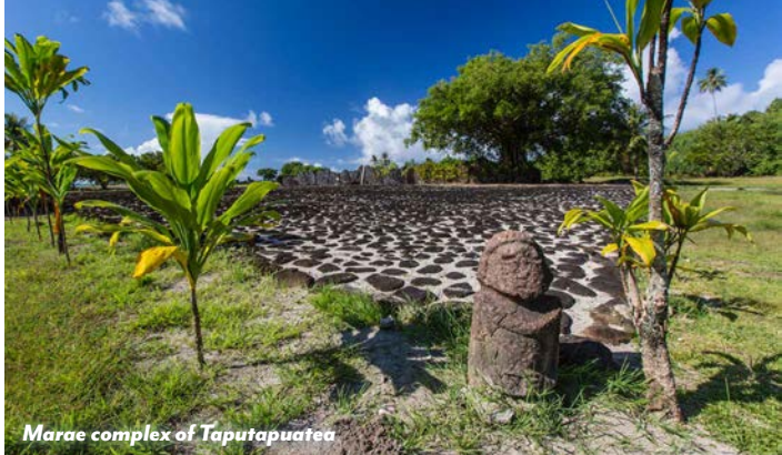
Marae complex of Taputapuātea