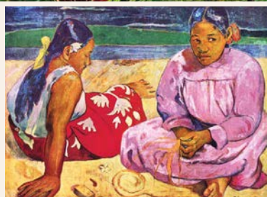
Paul Gauguin painting of Polynesian life

Seared into the collective consciousness by the paintings of Post-Impressionist artist Paul Gauguin, this fantasia of 118 islands and atolls remains steeped in the legends of a polytheistic society.