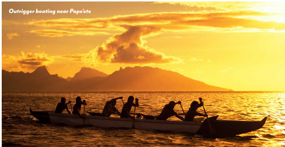
Outrigger boating near Pape'ete

For reservations, call Gohagan & Company at 800-922-3088 or visit gohagantravel.com/reserve