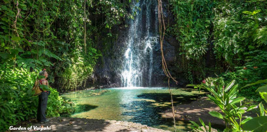
Garden of Vaipahi

today's optional excursions is an enriching Opa Heritage tour that takes you to visit French Polynesia's only UNESCO World Heritage site, the well-preserved marae complex of Taputapuatea. Finish this amazing day with a special barbecue beneath the stars. Partake in line dancing and a deck party by the pool afterwards.