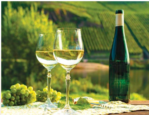
Below: Local Moselle wine | Right: Old Town, Würzburg

to see its centerpiece, the statue of Neptune. Continue towards the Obere Brücke and wander under the grand rococo archway to marvel at the red-roofed fishermen's houses and baroque mansions of Bamberg.