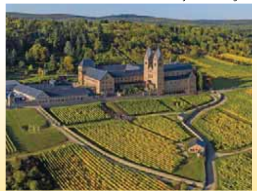
Abbey of St. Hildegard

AHI Connects | Musical Trio . Settle in for an exclusive performance by a talented trio in Heidelberg who will entertain you with holiday songs, arias and contemporary pieces.