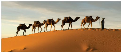
We ride camels in the Sahara on Day 8.

Day 12: Marrakech Our day-long tour includes the beautifully proportioned Koutoubia Mosque with its distinctive 282-foot minaret visible from miles away; the lovely Andalusian-style El Bahia Palace (part of