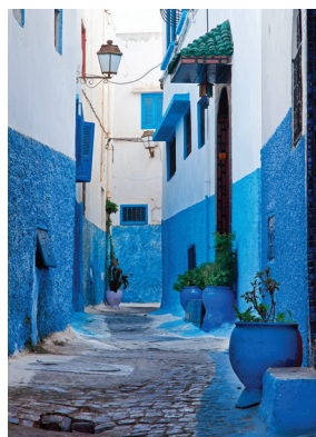
Rabat's Kasbah des Oudaias

Day 11: Marrakech Once the capital of southern Morocco, the imperial city of Marrakech is an alluring oasis with a temperate climate, distinct charm, and fascinating sights. This morning we travel by horse-drawn carriage from Menara Park to Majorelle Gardens, a private botanical garden with some 15 species of birds native to North Africa and known for its cobalt blue